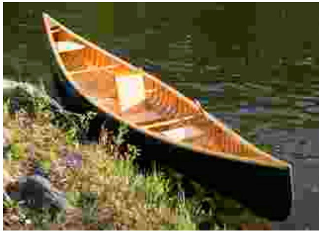
17' Chicot canoe

See Don Soar for tickets and information. 978-365-9689